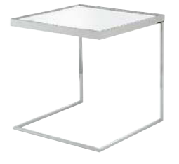
EVERYNIGHT Didier Gomez Refined pedestal table with a gloss white or black lacquer top and a matching base. Dimensions H 17¼" W 17¼" D 17¼"; H 45cm W 45cm D 45cm