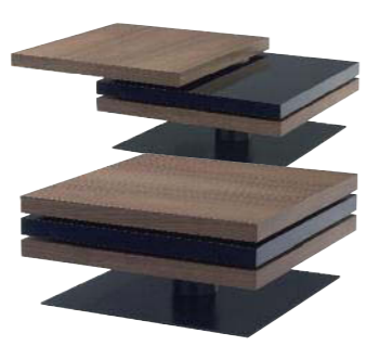
STRATES Pagnon & Pelhaître This occasional table has three superimposed leaves, two of which pivot. Available in walnut, dark brown or ebony oak veneer, or gloss white, taupe or black lacquer. Mono-chrome or choice of gloss white, black, red, bordeaux, taupe or guava lacquer on the middle leaf (white or black lacquer only for