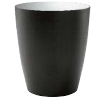
INOX François Bauchet Occasional table in matte black lacquered steel with a mirror-polished stainless steel top. Dimensions H 19¼" Ø 17¼"; H 50cm Ø 44cm