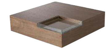
PLATO Jacques Dueru This square or rectangular occasional table is available in gloss white or black lacquer. New to the collection is a walnut veneer finish for the square table. The cutout in the corner of the table can accommodate a