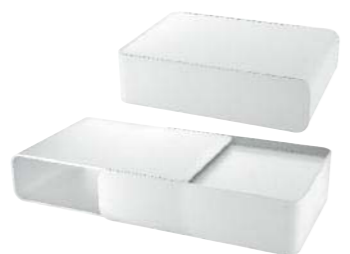
PEBBLE Air Design Group - Nathan Yong & Jerry Low Both tables are available in solid American walnut with a base in black lacquered steel. Dimensions H 6¼" W 45" D 31½"; H 29cm W 114cm D 80cm