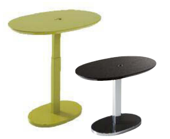
LUNATIQUE Inga Sempé This oval topped design is adjustable in height. The articulated ring set into the top facilitates this function: lifting the ring releases the top and lowering fixes the top in place. The top comes in ebony oak, or white, red or guava lacquer and can be paired with a matching or brilliant chrome base. Dimensions H 16¼"-25¼" W 22¼" D 14¼"; H 41-59cm W 58cm D 36cm