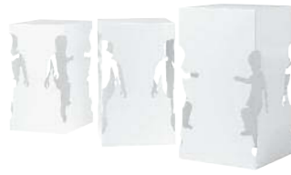
HIDE & SEEK Sigrid Strömgen Fun and stackable occasional tables in steel with a laser-cut kid silhouette design. Can also be used as stools. Gloss white lacquer finish. Available in three sizes.

Dimensions H 19 1/4" W 19 1/4" D 19 1/4"; H 50cm W 50cm D 50cm