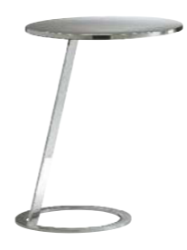
GOOD MORNING A.-S. Gilles Sleek pedestal table with a round top and an open circular base connected by a slender angled leg. Available in polished steel, or black, white or aluminum lacquer. Dimensions H 21¼" Ø 17¼"; H 55cm Ø 45cm