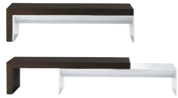
PELE-MELE Bernard Moïse This two-part low table pairs a white lacquer base with an overlapping and adjustable wood panel offered in white lacquer, or dark brown or ebony oak veneer. This playful model can rotate into various configurations. Also available as a TV unit.

Square Table H 4 1/4" / 9 1/4" / 14 1/4" W 19 1/4" D 19 1/4"; H 11 1/2" / 25 1/2" / 36cm W 50cm D 50cm Rectangular Table H 4 1/4" / 9 1/4" / 14 1/4" W 47 1/4" D 19 1/4"; H 11 1/2" / 25 1/2" / 36cm W 120cm D 50cm Round Table H 4 1/4" / 9 1/4" / 14 1/4" Ø 19 1/4"; H 11 1/2" / 25 1/2" / 36cm Ø 50cm