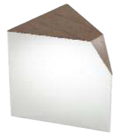
PENINSULA Angie Anakis Occasional table with polished stainless steel sides and an American walnut veneered top. Dimensions H 15" W 13¼" D 14¼"; H 38cm W 35cm D 37cm