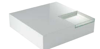
YO-YO 2 Pagnon & Pelhaître Fun and functional occasional table. It can be adjusted to a wide range of heights for convenience. The top comes in milk or anthracite glass with a base in white or graphite lacquered steel respectively. The two matching extensions leaves are stored within the table. Square Table H 11¼" W 37½" D 37½"; H 29cm W 95cm D 95cm Rectangular Table H 11¼" W 47¼" D 31½"; H 29cm W 120cm D 80cm