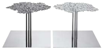
LES FORETS Pascal Mourgue This occasional table has a laser-cut tree motif top that exudes poetic style. Available in stone-grey or grey-brown lacquered steel. Mirror-polished stainless steel base.

Square Table H 11 1/2" W 39 1/4" W 39 1/4"; H 30cm W 100cm D 100cm Rectangular Table H 11 1/2" W 47 1/4" D 27 1/4"; H 30cm W 120cm D 70cm