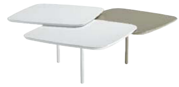
PATCH J.F. Dingjian & E. Chafaï This new low table features three rounded corner tops fixed at different heights and each mounted on a single central foot. Available in different color combinations: all black or all white lacquer, black or white and blue lacquer, or black or white and taupe lacquer. Dimensions H 15¼" W 43¼" D 43¼"; H 39cm W 110cm D 111cm