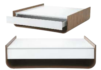
STEM Eric Jourdan This low table is offered as a square table with two opposing drawers or as a rectangular table with one drawer. Drawers have a push-latch mechanism. The structure in walnut veneer can be paired with a top and drawer(s) in white, taupe or black lacquer. Square Table H 12½" W 47¼" D 47¼"; H 32cm W 120cm D 120cm Rectangular Table H 12½" W 47¼" D 30¼"; H 32cm W 120cm D 78cm