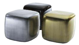
GLACON Lee West Small occasional table in enameled molded earthenware shaped like an ice cube. Shown in gold, platinum and copper but also available in black, white, red, turquoise, navy blue and black. Dimensions H 13¼" W 13" D 13"; H 34cm W 33cm D 33cm