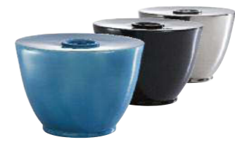
OFFRANDE Pascal Mourgue Occasional table in enameled earthenware with a removable bowl on the top. Available in a multitude of colors: white, gold, platinum, turquoise, navy blue, red, black and copper. Dimensions H 15" Ø 21¼"; H 38cm Ø 54cm