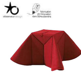
GREGORY Gregory Lacoua The central button and clever arrangement of folds across the surface of this rug hint at the trick to come. By pulling the button, the panels lift and the rug becomes an ottoman. Once released, the stool transforms into a rug again. Ottoman W 29½" D 29½" SH 17¼"; W 75cm D 75cm SH 44cm Rug W 47¼" L 47¼"; W 120cm L 120cm