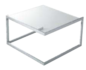
DIAMANT Frédéric Ruyant Exquisite occasional table with a clear glass top that is suspended by a brilliant chromed steel frame. Low Table H 13¼" W 23½" D 23½"; H 35cm W 60cm D 60cm High Table H 21¼" W 15¼" D 15¼"; H 55cm W 40cm D 40cm