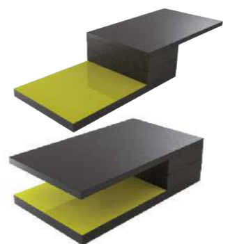
TRANSLATION Ligne Roset Versatile coffee table with dual surface areas that are linked by a state-of-the-art sliding mechanism. When closed, the top boasts an ebony oak veneered surface. When fully open, four gloss lacquered panels are exposed – choice of white, red or guava. An all white lacquer option is also offered. Dimensions H 9¼" W 35½" D 51¼" D 35½" D 51¼"; H 25cm W 90-130cm D 90-130cm