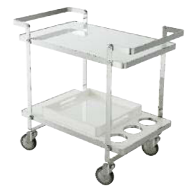
TROLLEY Frédéric Ruyant Convenient bar cart defined by its sleek white lacquer or ebony oak veneer finish, brilliant chrome structure and large casters. An optional square serving tray is also available. Cart H 29½" W 31½" D 17¼"; H 75cm W 80cm D 45cm Tray W 15¼" D 15¼" T 2"; W 40cm D 40cm T 5cm