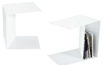
HELPER Karsten Weigel Small and practical side table with storage space for magazines. Made of gloss white lacquered steel.

Dimensions H 25 1/2" Ø 19 1/4"; H 65cm Ø 50cm