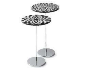
CHARLESTON Ligne Roset This small and elegant occasional table is composed of a brilliant chrome base and a hand inlaid marquetry top detailing a floral or checkerboard motif in black and white resin.

Dimensions H 15 1/4" W 21 1/4" D 21 1/4"; H 40cm W 55cm D 55cm