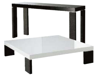
STRUCTURE Didier Gomez Stylish low table with a top available in white or black lacquer and feet finished in anthracite embossed veneer. The orientation of the feet alternates at each corner. Also offered as a console table.

Dimensions H 11 1/2" W 43 1/4" D 43 1/4"; H 30cm W 110cm D 110cm