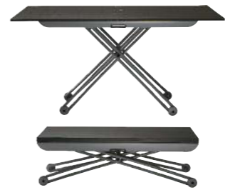
KARMA Didier Gomez This clever coffee table features a two-piece top that opens to reveal a translucent white interior tray in which magazines or remote controls may be stored. Available in white lacquer, or dark brown or ebony-stained oak veneer. Dimensions H 10½" W 55" D 28¼"-38½"; H 27cm W 140cm D 73-98cm