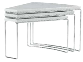
DOC Evangelos Vasileiou Set of three interlinked and pivoting tables which may be positioned to your liking in a circle. Base in brilliant chrome with tops in white Carrara marble. Dimensions H 14¼" Ø 38"; H 36cm Ø 97cm