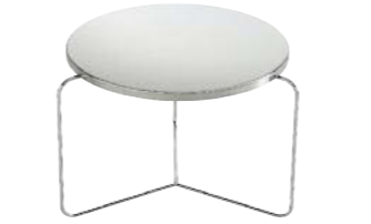
DECA Evangelos Vasileiou Round occasional table with a top in polished stainless steel or marble. The steel base has a brilliant chrome finish.

Dimensions H 17 1/2" W 13" D 21 1/4"; H 44cm W 33cm D 54cm