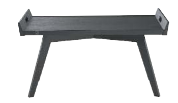
LUPO Pierre Paulin A reproduction of one of Pierre Paulin's first-ever creations. Lupo is notable for its clear geometric lines and four slanting legs. The top, with its cut-out handles, makes it a mobile table that may also be used as a serving or breakfast tray. Available in solid black-stained oak. Dimensions H 15¼" W 28¼" D 19¼"; H 39cm W 72cm D 50cm