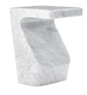
STUMP Pierre Charpin This new side table is carved from white Carrara marble. It is polished and treated to prevent stains. Dimensions H 17¼" W 11¼" D 14¼"; H 45cm W 30cm D 36cm