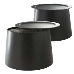
STASH Lee West Side table with a removable top, providing practical storage space. Covered with black buffalo hide. Dimensions H 14¼" Ø 19¼"; H 36cm Ø 50cm