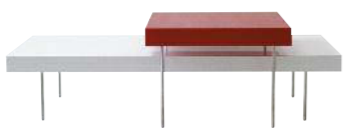
NEEDLE Arik Levy ©-Design Mix and match: square, rectangular and round tabletops with feet in brushed stainless steel. Available in dark brown or ebony oak veneer, or red or white lacquer. Choice of three heights for the feet.

Dimensions H 11 1/2" W 43 1/4" D 43 1/4"; H 30cm W 110cm D 110cm