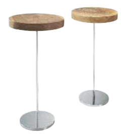
CHANTERELLE Ligne Roset Small pedestal table with a base in brilliant chrome and a top in solid walnut which can vary in size. Because of nuances in the wood, each table is unique. Dimensions H 20½" Ø 9¼" - 13¼"; H 52cm Ø 25cm - 35cm