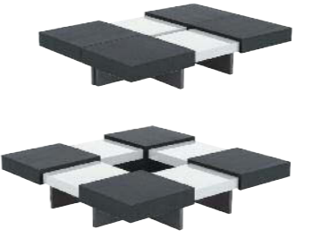
PONTON Deichmann & Osko This low double-surfaced table has a slatted top made of solid walnut and a clear glass bottom that both rest on the brilliant chrome base. A vase can be positioned on the lower surface to allow bamboo or reeds to pass through table, making a river scene. Square Table H 11¼" W 35¼" D 47¼" D 35¼" D 47¼"; H 30cm W 91/120cm D 91/120cm Rectangular Table H 11¼" W 47¼" D 27½"; H 30cm W 120cm D 70cm