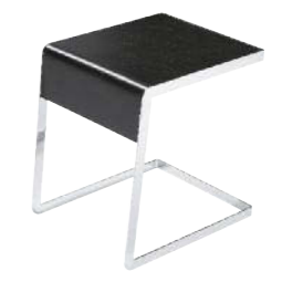
TROLLEY Frédéric Ruyant This trapezoid side table is a nice addition to the Trolley collection. Available in ebony oak veneer or white lacquer with a brilliant chrome structure. Dimensions H 19¼" W 15¼" D 19"; H 50cm W 40cm D 48cm