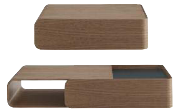
ADAM & EVE Meike Rüssler Extendable low table with two shells mounted on a sliding system: one is fixed, the other on castors. The exterior is available in white lacquer or walnut veneer and the interior comes in white or black lacquer.