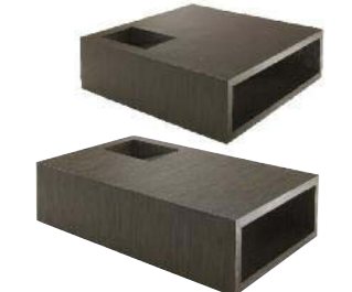
INBOX Jacques Ducru Square or rectangular occasional table with practical interior storage space and an exterior niche. Finished with an ebony-stained oak veneer. NOT AVAILABLE IN NORTH AMERICA.

Dimensions H 14 1/2" W 49 1/4" D 17"; H 37cm W 125cm D 43cm