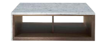
AIR Fred Rieffel This low table can be lengthened by rotating its top. It is available either in all gloss white lacquer or in ebony oak veneer with a choice of gloss white, red or guava lacquer for the interior surface. Dimensions H 12¼" W 39¼" D 65" D 23½"; H 32cm W 100-165cm D 60cm