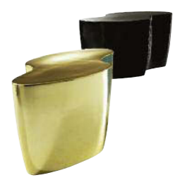
PALETTE Pascal Mourgue This occasional table has the shape of a painter's palette. It is made of molded enameled ceramic. Available in white, red, black, turquoise, navy blue, platinum, gold and gunmetal. Dimensions H 13¼" W 25½" D 13½"; H 35cm W 65cm D 34cm