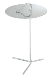
LOVE ME Martino D'Esposito Charming pedestal table with a top in mirror-polished stainless steel. The handle, in the shape of a half-heart, is reflected on the top to form a complete heart. The steel base has a brilliant chrome finish. Dimensions H 22½" Ø 13½"; H 57cm Ø 34cm