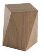
ROCHER Hertel & Klarhoefer Rock-shaped occasional table in American walnut veneer. Dimensions H 17¼" W 16½" D 16½"; H 45cm W 42cm D 42cm