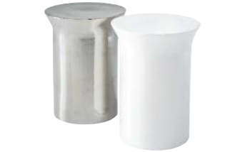
SPOOL Eric Jourdan Small occasional table in molded earthenware with gloss white or platinum enamel.

Small Table H 15 1/4" W 9" D 9"; H 39cm W 23cm D 23cm Medium Table H 16 1/4" W 9 1/4" D 9 1/4"; H 41cm W 25cm D 25cm Large Table H 18 1/4" W 10 1/4" D 10 1/4"; H 48cm W 27cm D 27cm