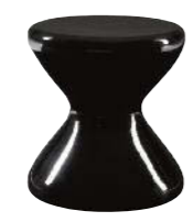
BOB Lee West Occasional table in black lacquered fiber-glass. Can also serve as a small stool. Dimensions H 13¼" Ø 12½"; H 35cm Ø 32cm