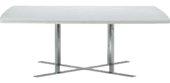
TAZIA Pascal Mourgue This low table is offered with a top in a special white lacquer, which is resistant to scratches. The steel base has a brilliant chrome finish. Dimensions H 23½" W 55" D 55"; H 60cm W 140cm D 140cm