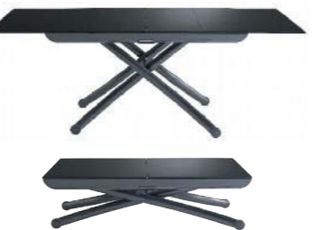
CRESCENDO Pagnon & Pelhaître Convertible table that offers a wide range of heights. The top pivots 90° and unfolds to double the surface, easily transforming the coffee table into a dining table. Comes in ebony oak, milk glass and white lacquer, or anthracite glass and black lacquer. Steel base in white or graphite lacquer. Dimensions H 15"-29¼" W 49¼"-76¼" D 31½"; H 38-74cm W 125-194cm D 80cm