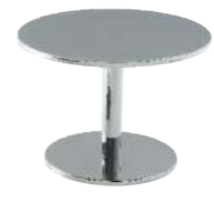
BOBINE Michael Koenig This low table has a round top and a brilliant chromed steel base. The top is available in two sizes and comes in brilliant polished steel. Small Table H 11¼" Ø 19¼"; H 30cm Ø 50cm Large Table H 19¼" Ø 27½"; H 50cm Ø 70cm