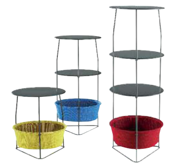
ZANA Pierre Charpin Original and practical pedestal table. One, two or three shelves are fused with the black lacquered steel frame. Available with one or two storage baskets, depending on the size. Small Table H 21¼" Ø 19"; H 55cm Ø 48cm Medium Table H 37¼" Ø 19"; H 96cm Ø 48cm Large Table H 52" Ø 19"; H 132cm Ø 48cm