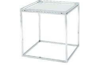
LUX Soda Designers Elegant illuminated table for dramatic lighting of bottles or whatever you choose. Steel frame with a brilliant chrome finish and matte glass top bordered by 120 white LEDs. NOT AVAILABLE IN NORTH AMERICA.

Dimensions H 17 1/4" / 19 1/4" Ø 11"; H 44 / 50cm Ø 28cm