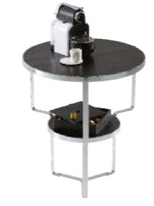
TROLLEY Frédéric Ruyant Coffee table available in white lacquer or ebony oak veneer with a brilliant chrome structure. An additional storage box for coffee and tea is also offered. Dimensions H 29½" Ø 25¼"; H 75cm Ø 65cm