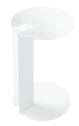
JEEVES Colin O'Dowd Clever small side table that can prop open a door. Available in gloss white lacquered steel. Dimensions H 19¼" Ø 12¼"; H 49cm Ø 31cm